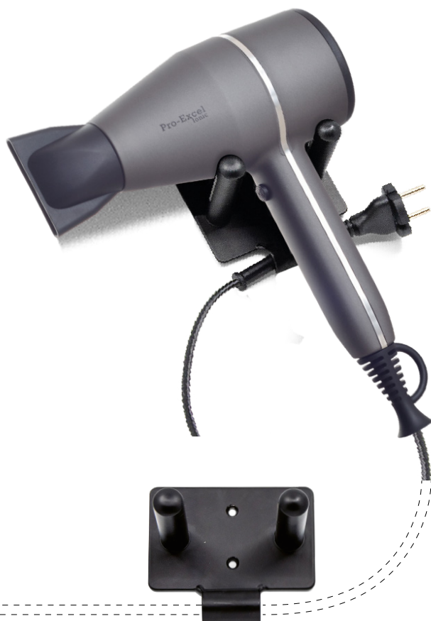
ANTI-THEFT Wall holder "Vane" with cable lock

Professional hand-held hairdryer with anti-theft wall holder "Vane" (optional)